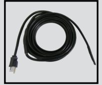
Use with CWR Cable

The CWR IceFree™ Controller is designed specifically for use with King’s CWR constant wattage roof and gutter De-Icing cable. Take the hassle out of managing residential roof de-icing with automatic control.