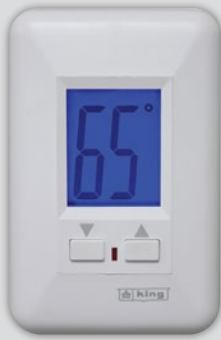
ES120 ES230 Non Programmable