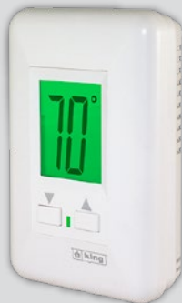
HW120 Non Programmable For Hydronic Heaters