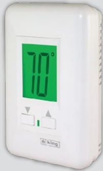
HW120 Non Programmable For Hydronic Heaters