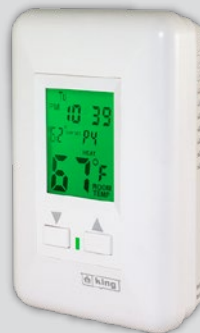
HWP120 Programmable For Hydronic Heaters