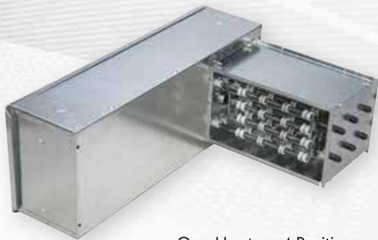
One Heater - 4 Positions