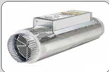
Complete supplemental heater system