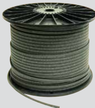
1,000 ft. Reel