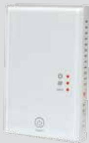
KING F912GFCI Slave