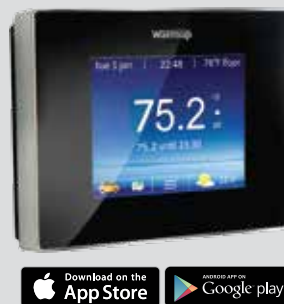
WARMUP 4IE04-BLACK/WHITE Programmable