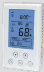
KING F902GFCI Programmable