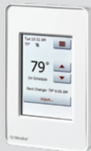
OJ UWG4-4999 Programmable