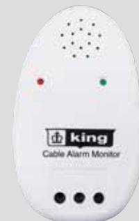
FCS11 (Cable Alarm)