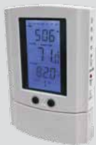
KING F802GFCI Programmable