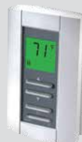
HONEYWELL/AUBE TH115-AF-GA Programmable

King electronic thermostats are designed to achieve maximum comfort from King cable heating systems. Common feature to all models include: