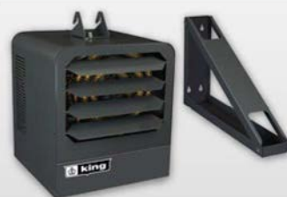
KB Series Heavy Duty Unit Heater 208/240/277/480V / 4,000-40,000W