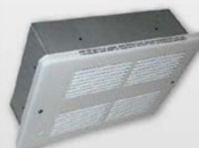
WHFC Series Small Ceiling Heater