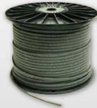
CT Series De-Icing Cable Class1 Div 2

Self-Regulating 120/240V / 5/8/12/14.8W / LinFt @ 32°F