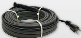
SRP Series Pipe Trace Cable

Pre-Assembled Self-Regulating 120/240V / 6W/LinFt @ 40°F