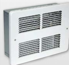
WHF-HM Series High Wall Heater