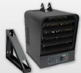
SKB Series Compact Heavy Duty Unit Heater 208/240V / 5,000-10,000W

NOW COMPATIBLE WITH NEST OR ANY 24V STAT