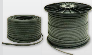
SR Series De-Icing Cable

Pre-Assembled Self-Regulating 120/240V / 8W/LinFt @ 32°F