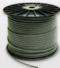
CT Series Pipe Trace Cable Class1 Div 2

Self-Regulating 120/240V / 3/5/8/10W/LinFt @ 40°F