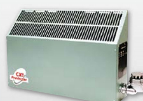
CX1 Series Explosion-Proof Heater 120/208/240/277/380/400/415/480/600V 1,200-7,600W