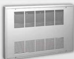
KCC Series Convection Cabinet Heater 208/240/277/480V / 2,000-5,000W