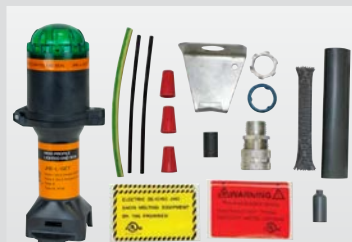
SR/SRP Series Accessories