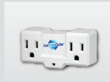
Controls & Sensors Pipe Freeze