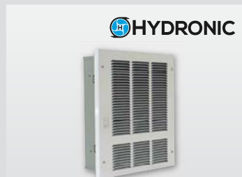
HM / HME Series Medium Hydronic Heater 120V / 3,300 - 18,700 BTU