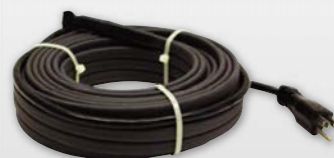
SRP Series De-Icing Cable

Pre-Assembled Self-Regulating 120/240V / 8W/LinFt @ 32°F