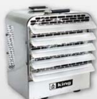
PKBS Series Stainless Steel Industrial Portable Unit Heater 208/240/480V / 5,000-20,000W