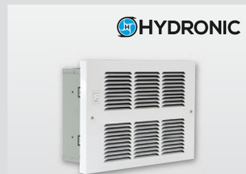
H Series Small Hydronic Heater 120V / 1,200 - 10,500 BTU