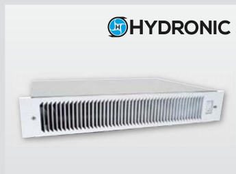
HT Series Under-Cabinet Hydronic Heater 120V / 1,600 - 9,950 BTU