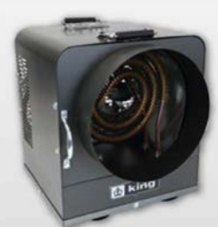
PKB-DT Series Ducted Industrial Portable Unit Heater 208/240/480V / 5,000-15,000W