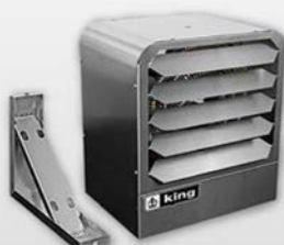
KBS Series Stainless Steel Unit Heater 208/240/277/480V / 3,000-20,000W