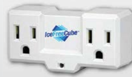
Controls & Sensors Pipe Freeze