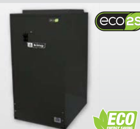
KFS ECO2S Series Electric Furnaces 208/240V / 4,000-34,500W