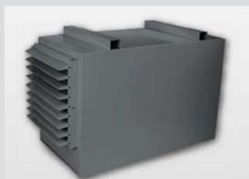
CK Series Plenum Rated Unit Heater 208/240/480V / 3,000-50,000W