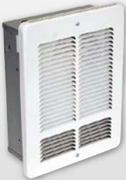
W Series Wall Heater