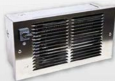
DAW-SS Series Stainless Steel Marine Heater