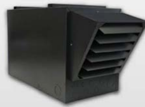
KFUH Series High Air Velocity Unit Heater 208/240/480V / 3,000-34,500W