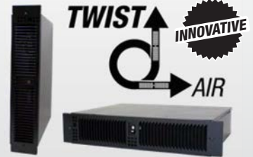
KTW Series Horizontal/Vertical Kickspace Heater