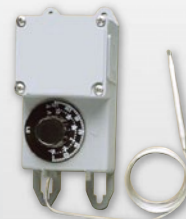
TRF115-005 Freeze Protection Thermostat

Self-Regulating 120/240V / 3/5/8/10W/LinFt @ 40°F