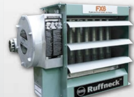
FX6 Series Explosion-Proof Heater 208/240/277/380/400/415/480/600V 3,000-35,000W