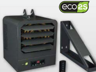
KB ECO2S Series 2-Stage Electronic Unit Heater 208/240V / 4,000-15,000W