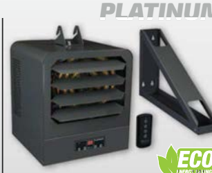
KB Platinum Series Heavy Duty Electronic Unit Heater 208/240/277/480V / 3000-40,000W