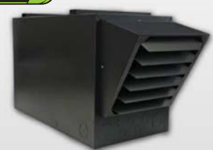
KFUH Series High Air Velocity Unit Heater w/ECM Motor 208/240/480V / 3,800-70,000W