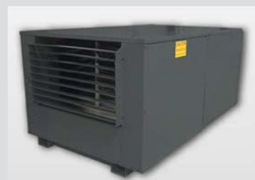
CKL Series Large Plenum Rated Unit Heater 208/240/480V / 30,000-240,000W