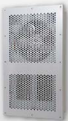
LPWV Series Vandal-Resistant Heater