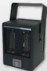
EKB Series Garage/Shop Heater 208/240V / 2,850-5,000W