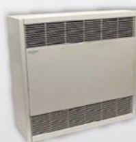
KCA Series Cabinet Heater 208/240/277/480V / 2,000-24,000W