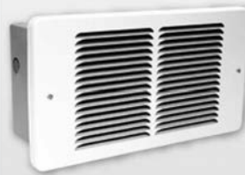
PAW Series Wall Heater