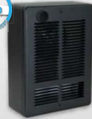
WSC Series Economy Wall Heater