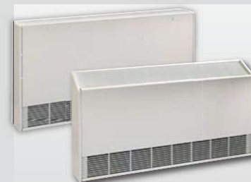
KLA / KLI Series Architectural Convection Heaters 208/240/277V / 1,500-6000W