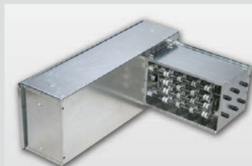
E Series Flippable Electric Duct Heater 120/208/240/277/480V