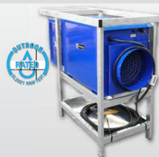
PCKF Series Industrial Portable Unit Heater 208/240/480V / 10,000-25,000W