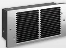
PAW-SS Series Stainless Steel Marine Heater