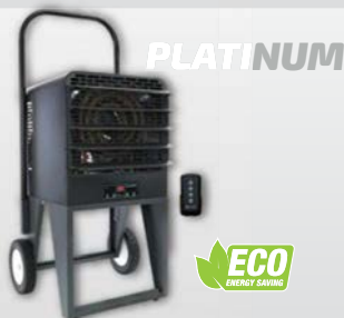
PKB Platinum Series Industrial Electronic Portable Utility Heater 208/240/480V / 7,500-20,000W