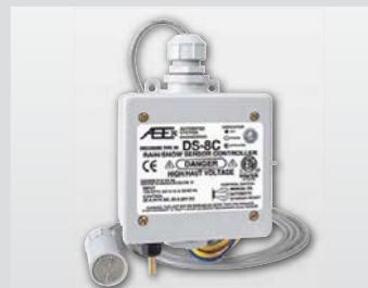
Controls & Sensors Roof & Gutter