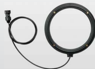
PFO MistKit (Optional) Converts Fan to Misting Fan