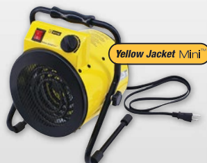
PSH1215T Yellow Jacket Portable Shop Heater 120V / 1,500W