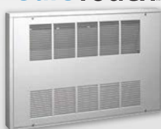
KCF Safetouch Series Compact Fan Forced Cabinet Heater 208/240/277/480V / 500-5,000W