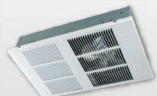
LPWC Series Large Ceiling Heater