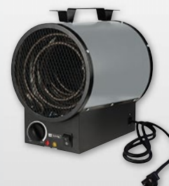
PGH2440TB Portable Utility Heater 240V / 3,750W