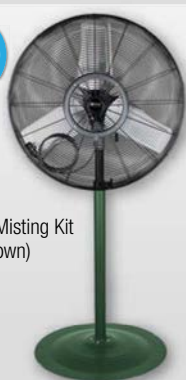
Optional Misting Kit (Shown)