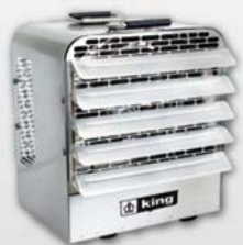
PKBS Series Stainless Steel Industrial Portable Unit Heater