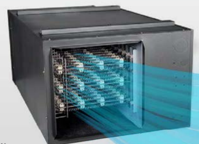
MAU Series Make Up Air Unit 208/240/480V / 3,800-34,500W