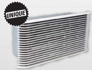
PAW Ultra Series Wall Heater