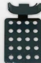
SRK13 Roof Clips

Self-Regulating 120/240V / 5/8/12/14.8W / LinFt @ 32°F