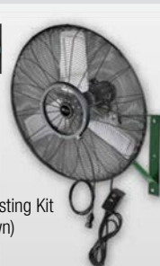
Optional Misting Kit (Shown)