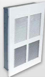
EFW-MW Series Economy Large Wall Heater