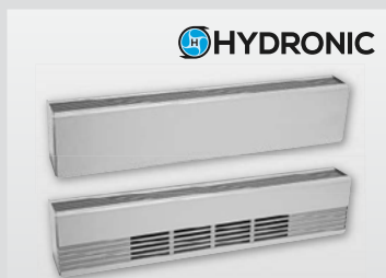
HLB / HSB Series Draft Barrier 400 to 1,000 BTU per FT.