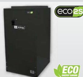
KF ECO2S Series Electric Furnaces 480V / 3,800-34,500W