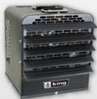
PKB-FM Series Industrial Portable Unit Heater 208/240/480V / 5,000-20,000W