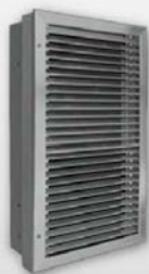
LPWA Series Architectural Heater