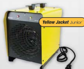
PSH2440TB Yellow Jacket Portable Shop Heater 208/240V / 3,750W