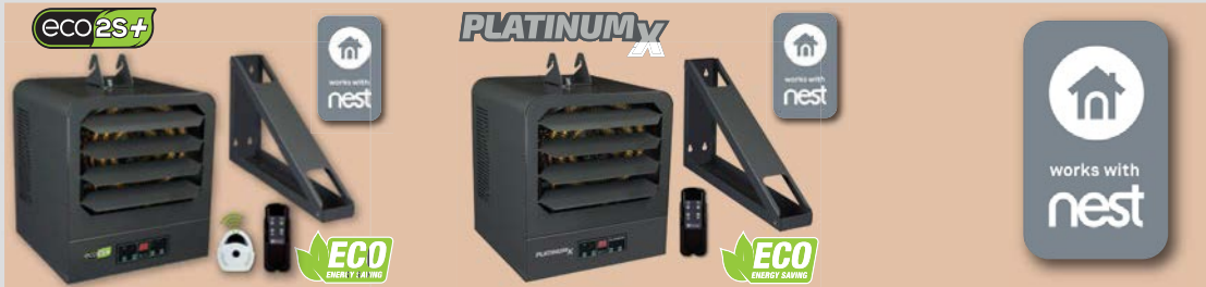
KB ECO2S PLUS Series 2-Stage Electronic Unit Heater w/Remote 208/240V / 4000-15,000W