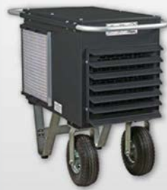
PCKW Series Industrial Portable Wheeled Unit Heater 208/240/480V / 10,000-30,000W