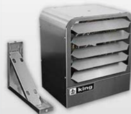
KBS Series Stainless Steel Unit Heater