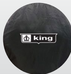
FO-Covers (Available in 24" & 30") Fan Cover Water / UV Resistant