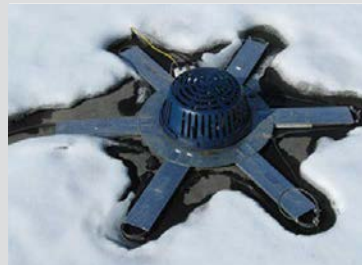
Roof/Drain De-Icing System