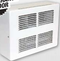
SL Series Surface Mounted Wall Heater