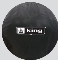
FO-COVERS (Available in 24" & 30")