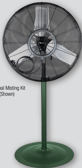
Optional Misting Kit (Shown)