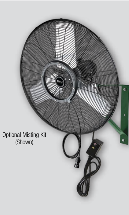
Optional Misting Kit (Shown)