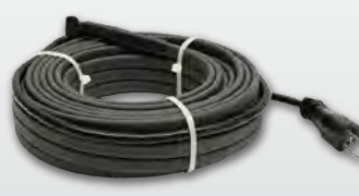
SRP Series Pipe Trace Cable Pre-Assembled Self-Regulating 120/240V / 6W/LinFt @ 40°F