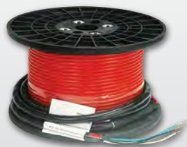
SC Series Snow Melt Cable 208/240/480V / 12W/LinFt