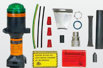
SR/SRP Series Accessories