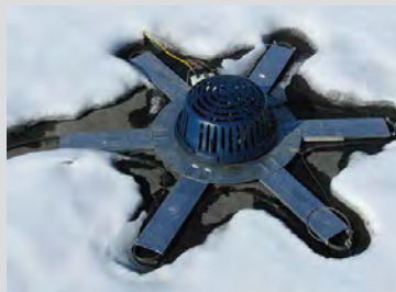
Roof/Drain De-Icing System