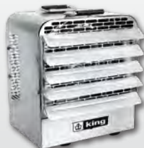
PKBS Series Stainless Steel Industrial Portable Unit Heater 208/240/480V / 5,000-20,000W