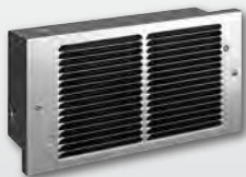
PAW-SS Series Stainless Steel Marine Heater