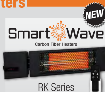
RK Series Infrared Radiant Heater

120/208/240V / 1500-4500W 1 Lamp/2 Lamp/3 Lamp Option