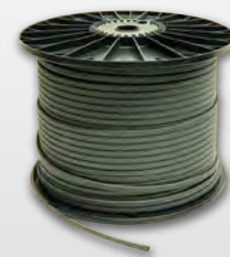
SR Series Pipe Trace Cable Self-Regulating 120/240V / 3/5/8/10W/LinFt @ 40°F