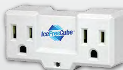
Controls & Sensors Pipe Freeze