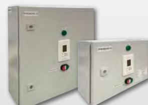
PYRO Series Pipe Trace System Snow Melt De-Icing System Up to 4 Zones / GFCI