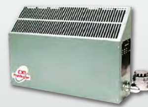
CX1 Series Explosion-Proof Heater

208/240/277/380/400/415/480/600V 3,000-35,000W