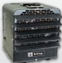
PKB-FM Series Industrial Portable Unit Heater 208/240/480V / 5,000-20,000W