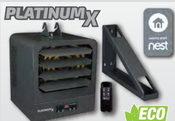
KB Platinum X Series Electronic Unit Heater