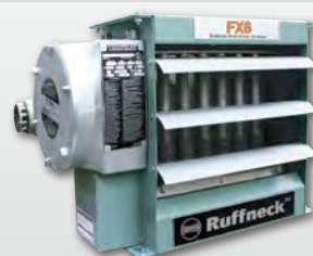
FX6 Series Explosion-Proof Heater

208/240/277/380/400/415/480/600V 3,000-35,000W