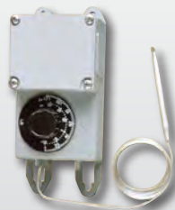
TRF115-005 N.E.M.A. 4X 120/208/240/277/480V / 25A