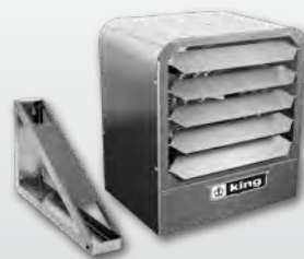
KBS Series Stainless Steel Unit Heater