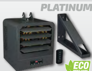
KB Platinum Series Electronic Unit Heater