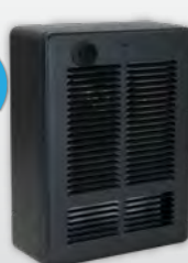
WSC Series Economy Wall Heater 120/208/240V / 500-2,000W