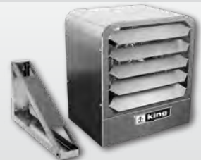
KBS Series Stainless Steel Unit Heater