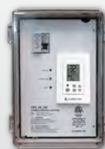
PYRO FPC Series Freeze Protection Controller 120/240V / 30A / GFEP / ModBus