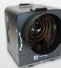
PKB-DT Series Ductable Industrial Portable Utility Heater