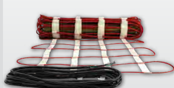
SCM Series Snow Melt Mats 208/240/480V / 36-40W/SqFt