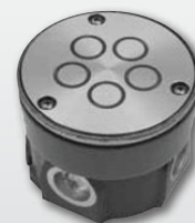
Controls & Sensors Snow Melt