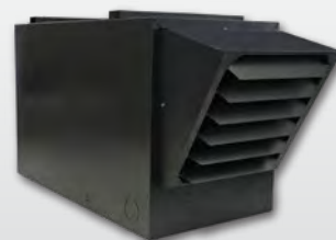
KFUH Series High Capacity Unit Heater