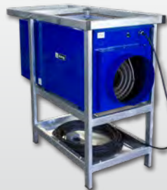
PCKF Series Industrial Portable Unit Heater