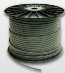
CT Series Pipe Trace Cable Class1 Div 2 Self-Regulating 120/240V / 3/5/8/10W/LinFt @ 40°F