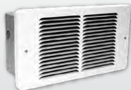
PAW Series Wall Heater