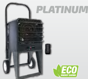
PKB Platinum Series Industrial Electronic Portable Utility Heater