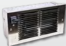
DAW-SS Series Stainless Steel Marine Heater