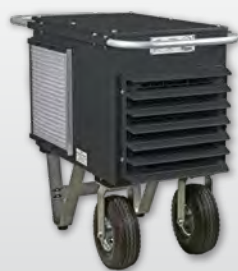
PCKW Series Industrial Portable Wheeled Unit Heater