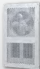
LPWV Series Vandal-Resistant Heater