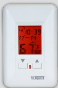
ESP120 ESP230 Programmable