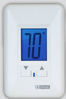
ES230 Non Programmable