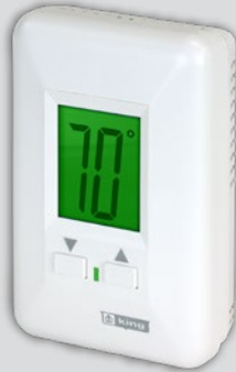
HW120 Non Programmable For Hydronic Heaters