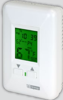
HWP120 Programmable For Hydronic Heaters HWPT120 Programmable Adds Timer for Pump