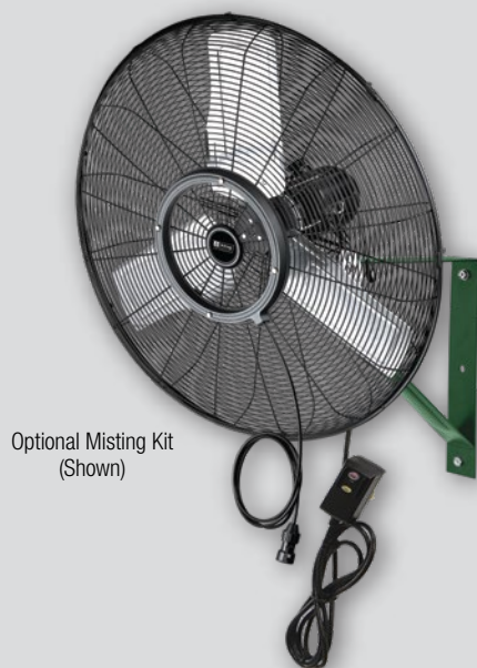
Optional Misting Kit (Shown)