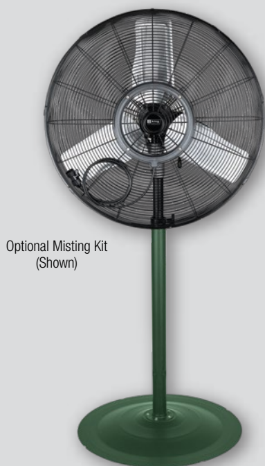
Optional Misting Kit (Shown)