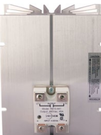
Solid State Relay (SSR)

By adding a VFD to an AC motor, speed can be varied with precision. Variable frequency drives sit between the electrical supply and the motor. Power from the electrical supply goes into a drive and the drive then regulates the power that is fed to the motor. This step allows the drive to adjust the frequency and the voltage that fed into to the motor based on your current process demands. This means you run your AC motors at the speed or with the torque according to the demand needed. This is why you can save large amounts of money using the AC drives.