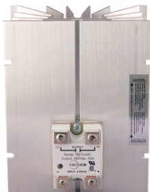
Solid State Relay (SSR)

By adding a VFD to an AC motor, speed can be varied with precision. Variable frequency drives sit between the electrical supply and the motor. Power from the electrical supply goes into a drive and the drive then regulates the power that is fed to the motor. This step allows the drive to adjust the frequency and the voltage that fed into to the motor based on your current process demands. This means you run your AC motors at the speed or with the torque according to the demand needed. This is why you can save large amounts of money using the AC drives.