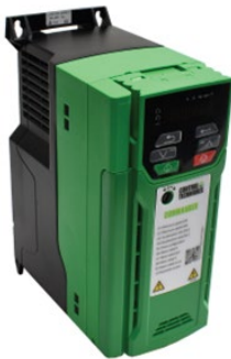
Variable Frequency Drive

Variable pitch sheaves (VPSs) are a simple method to vary fan speed to meet the required air flow specifications. The secret is within the threaded, angular faced discs that are the core of the V-shaped groove on each pulley. If you need more speed, move the discs toward each other. This alignment produces a belt that simply rides higher in the groove. To reduce the speed, simply increase the space between the two discs, which slows down the belt's motion.