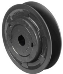
Variable Pitch Sheave

The King CKL make up air unit is equipped with a 1 to 8 step controller and an optional vernier stage. This provides on/off control for each heating stage plus one fully modulating step when ordered with Solid State Relays (SSR). The SSR option must be ordered to enable the vernier control option. For example, a 240KW unit will have 7 on/off steps at 30KW and 1 fully modulating step. The last 30KW step will modulate from 0 to 30KW to precisely control the discharge temperature. This is the most cost-effective way to achieve high quality temperature control.