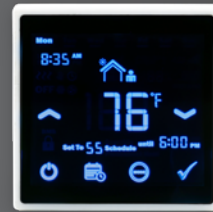
ECO PRO Controller