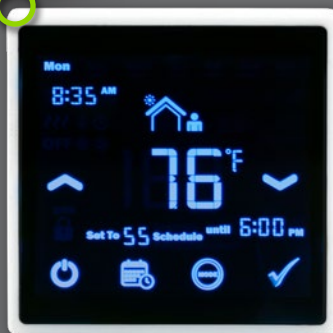
ECO PRO Controller