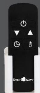
Includes IR Remote

SmartWave carbon fiber radiant heaters transfer heat to people and objects without heating the surrounding air. Featuring CarbonIQ, carbon fiber elements, that produce high-output medium-wave infrared heat with a soft visible orange glow. SmartWave heaters are a great choice for outdoor patios and applications where high heat is required but less visible light is desired. Featuring an integrated built-in controller which you can select between the 2 different heat levels or set a 24 hour timer to only heat the space while you are using it. It's that easy. Add the simple hand-held remote control and comfort is always in the palm of your hand.