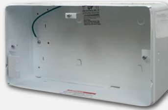
Surface Wall Enclosure