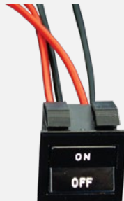
Double Pole Disconnect