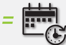
7-Day Programmable Heating Schedule