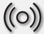
Remote Temperature Sensing