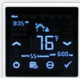
Eco Pro Controller