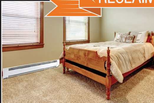
Standard Baseboard Heater