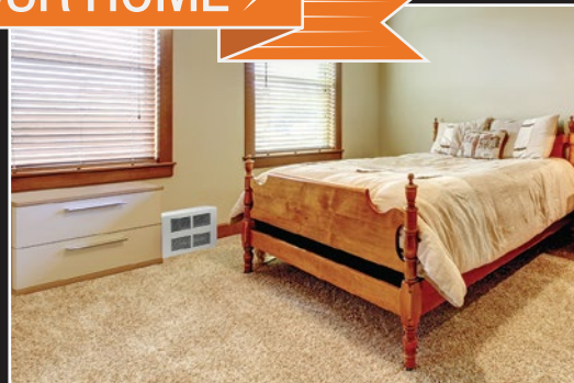
New Slimline Space Saving Heater