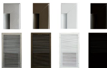
Satin Nickel Oiled Bronze White Satin Black