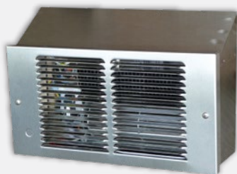
Intended for use on inspected vessels