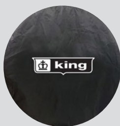
FO-COVERS (Available in 24" & 30")