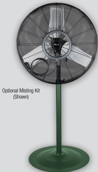
Optional Misting Kit (Shown)