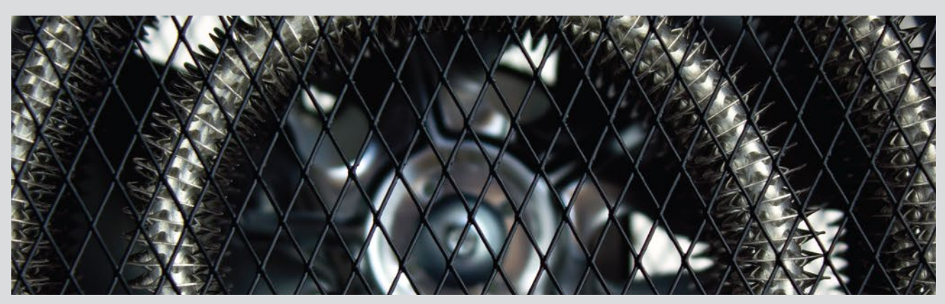
Spiral Steel Fin Heating Element For Maximum Heat Exchange