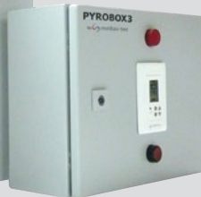
PYROBOX3 & 3C