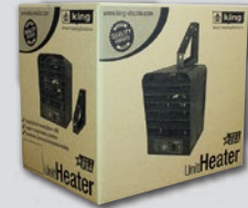
Kraft box packaging