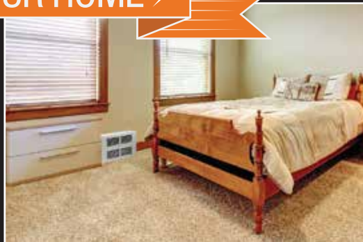
New Slimline Space Saving Heater