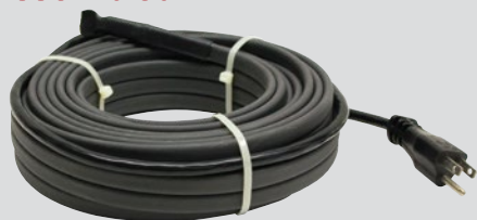
120 Volt - Grounded Plug