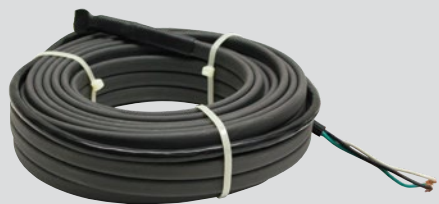
240V - Cold Leads