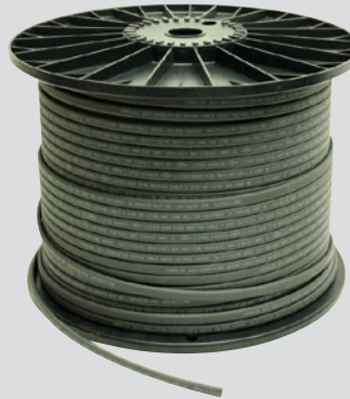
1,000 ft. Reel